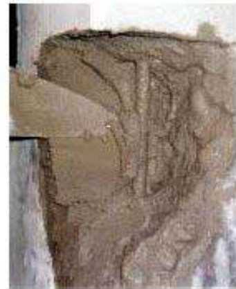
Apply the mortar

Mixing. A 25 kg bag of MAXREST is mixed with between 3,5 to 4,0 litres of clean water, depending on the ambient conditions and the consistency required, either manually or mechanically by low speed drill (400 – 600 rpm). MAXREST takes fifteen to twenty minutes to set, depending on the temperature. Mix only the amount of MAXREST that can be applied within eight to ten minutes.