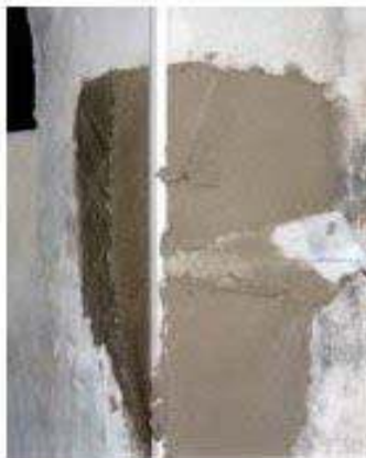
Finish the edge