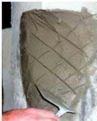
Scratch the surface

takes ten to twenty minutes to set, depending on the temperature. Make sure that whatever quantity of maxrest you mix can be applied within eight to ten minutes.