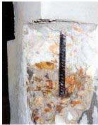
Damp the surface

around the bars for an efficient cleaning and to surround it with a minimum thickness of at least 1 cm of MAXREST . Eliminate rust by metal brush, needle gun, sand or shot blasting, etc. Apply the protector and oxide converter MAXREST PASSIVE (Technical Bulletin N° 12). After cleaning, wash the concrete with water. Before applying MAXREST , wet the surface but do not leave free-standing water.