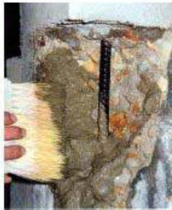
Apply the primer